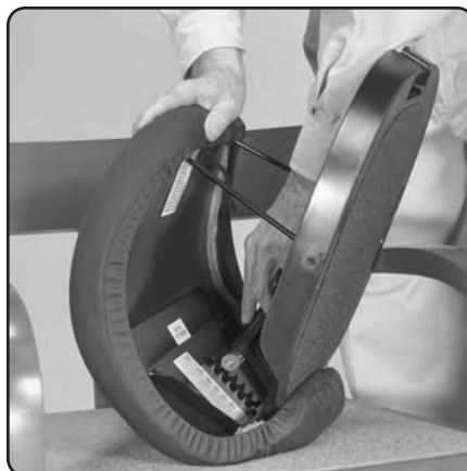
Select a weight setting suited to the user and center lifting mechanism between the appropriate slots.