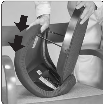
Push down , flexing the upholstered part of the seat.

3 Select a weight setting. Center the lifting mechanism pin between the two grooves for user's appropriate weight. Make sure it is fitted securely in the center of the weight slots. (The printed numbers on the setting gauge are only a guideline. The setting you choose should be according to the user's ability and preference. Choosing a weaker setting will still allow a gentle lowering into the chair but will not provide as much force on rising.)